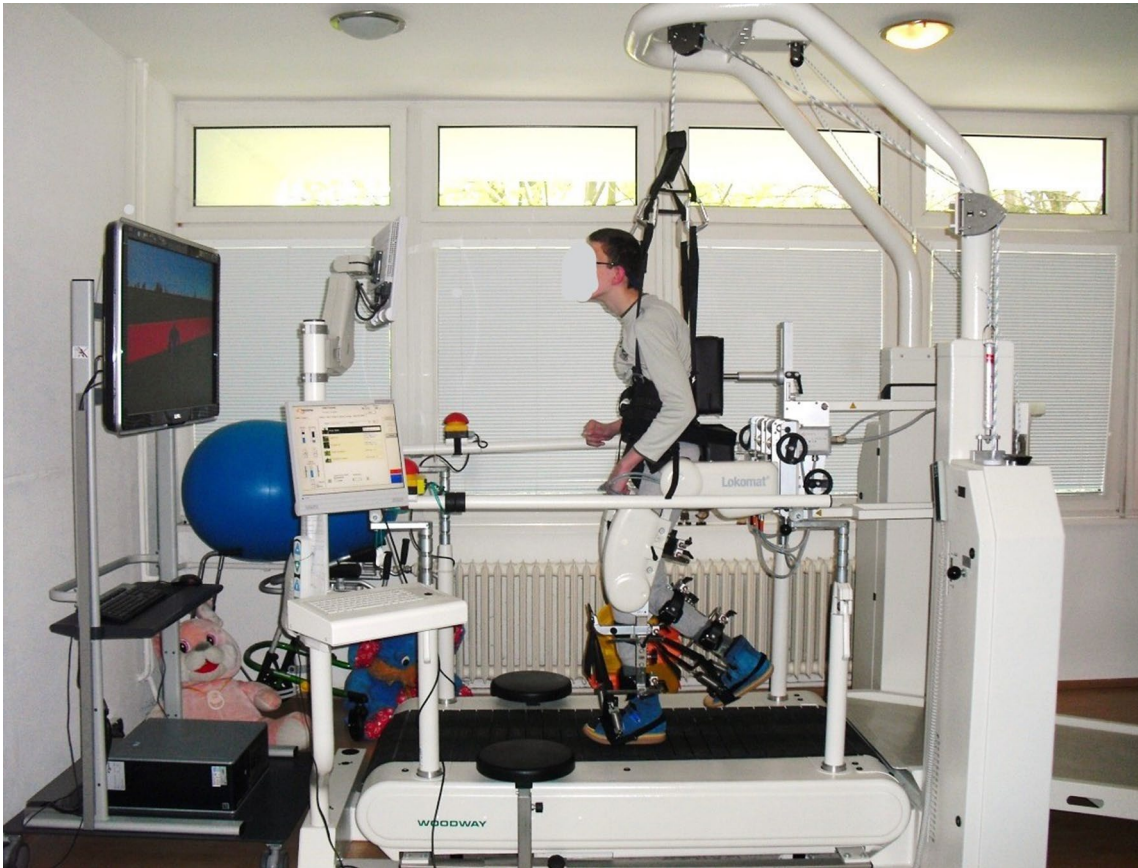
Fig. 2 Robot-assisted locomotion therapy in a virtual reality-based environment in the Lokomat®